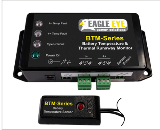
BTM-Series Monitor & Sensor